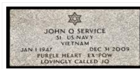
Flat granite Grave Marker