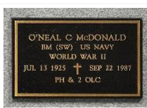
Bronze Niche Marker

To apply for a bronze medallion for the marker you need VA Form 40-1330M. Go to https://www.va.gov/find-Forms/about-form-40-1330M/ . Medallions are for privately purchased headstones and markers.