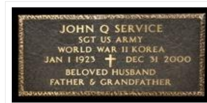
Flat Bronze Grave Marker